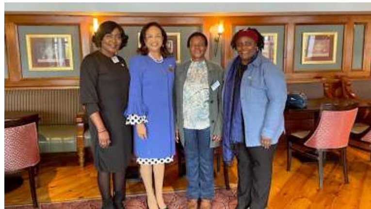
The Worldwide President of Mother's Union in Springfield Hotel Leixlip with CMC members