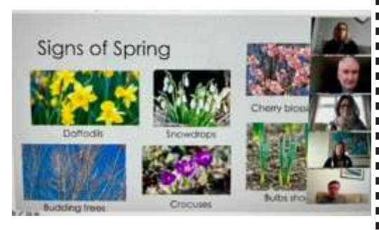
Zoom Assembly for CNS